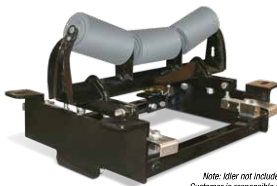
Note: Idler not included. Customer is responsible for mounting idler to weigh frame.

Guidelines assume clean belt with automatic tensioning system. Accuracy guidelines are typical. System accuracy may vary depending on environmental influences.