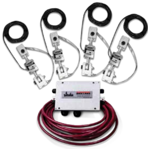
Available in configurations with three or four mounting assemblies. Picture is a representation of actual product.

The ITCM Series utilizes several Rice Lake Weighing Systems components to provide an unmatched level of performance in tank and hopper weighing applications and mechanical scale conversions. The ITCM incorporates clevis and unique rod-end ball joint assemblies to reduce the overall length to less than half of the traditional tension cell mounts, while providing correct load alignment. In addition, the load cell is completely electrically isolated from stray currents, which are a major cause of load cell failure. To complete the design, a grounding strap connects the two clevis assemblies to further provide safety to your load cells.