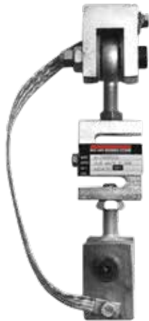
Module with RL20000 s-beam load cell.

The ITCM Series utilizes several Rice Lake Weighing Systems components to provide an unmatched level of performance in tank and hopper weighing applications and mechanical scale conversions. The ITCM incorporates clevis and unique rod-end ball joint assemblies to reduce the overall length to less than half of the traditional tension cell mounts, while providing correct load alignment. In addition, the load cell is completely electrically isolated from stray currents, which are a major cause of load cell failure. To complete the design, a grounding strap connects the two clevis assemblies to further provide safety to your load cells.