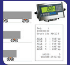
Truck Weighing with the R423 Stainless Steel Indicator