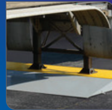
Landing Gear Scale for Trailer Checkweighing