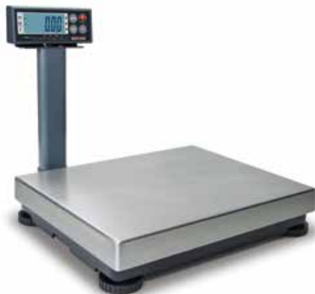
Shown with 174783