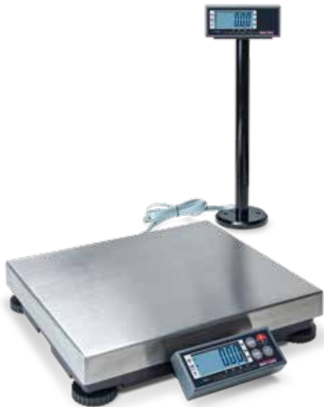
BP-P shown with 183103 and 180901