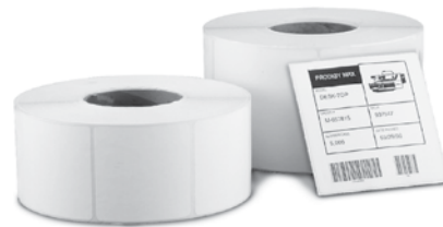
DTL-SYN Direct Thermal Synthetic Label