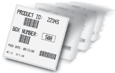
DTL-Plus High-speed Thermal Transfer Label