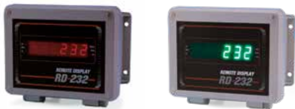
RD-232 NEMA Type 4X FRP Enclosure