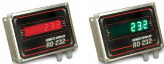
RD-232 Compact Stainless Steel Wall Mount Enclosure