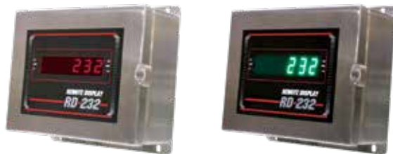
RD-232 NEMA Type 4X Stainless Steel Wall Mount Enclosure