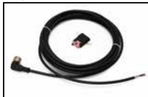
Power Cable PN 131221