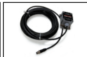
Onboard Inclinometer PN 131222