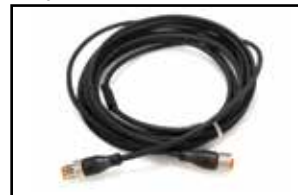
Homerun Cable PN 131228

Compatibility note: The Loadrunner dump truck kit has been designed for use on dual pin hinge pivot type dump bodies only. For dump truck body rear pivot assemblies using a single hinge bar, contact Rice Lake.