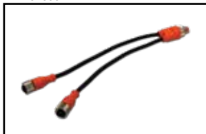
Y-Splitter Cable PN 131226