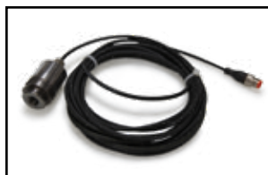
Hydraulic Transducer PN 131211