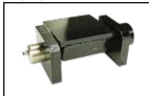
Dump Truck Hardware Kit