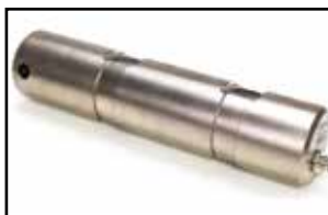
Dump Truck Load Pin PN 181895