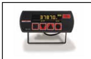
OB-350 Indicator PN 131219