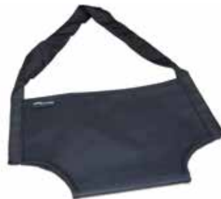
Optional suspended pediatric sling trousers