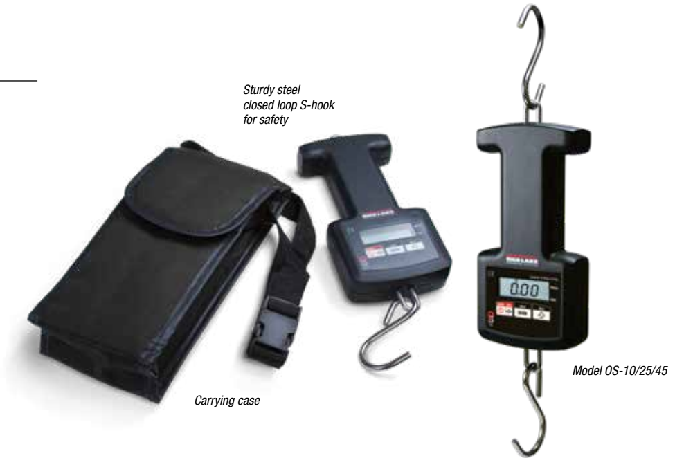
Sturdy steel closed loop S-hook for safety