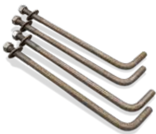
Anchor bolt with nut and washer