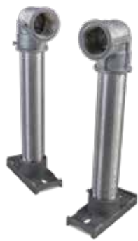
Side Mount Brackets