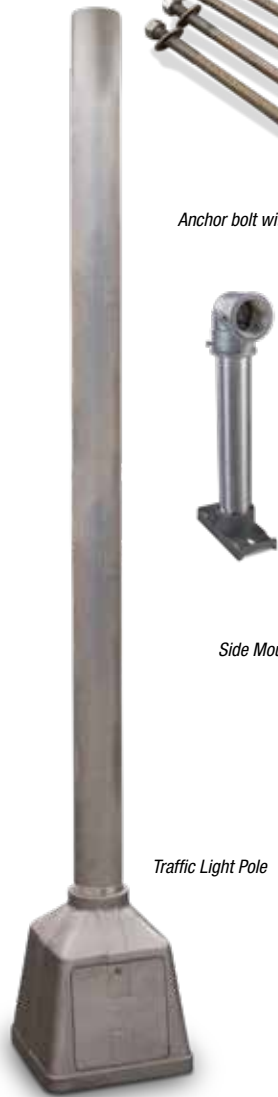
Traffic Light Pole