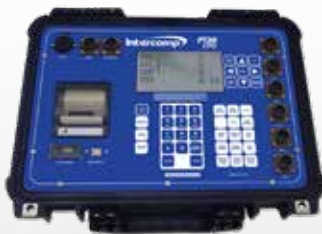
PT20™ WIM CPU

Provides the ability to process weight-related data and is self-enclosed with a thermal printer in a rugged, all-weather case for use in even the most remote locations. Collect and totalize axle weight, gross weight, vehicle ID & class for reporting and data collection.