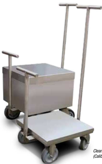
Clean Room, Weigh Cart (Calibration Optional)